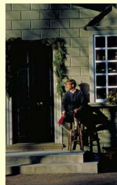
Winter Light by Mickey Rountree