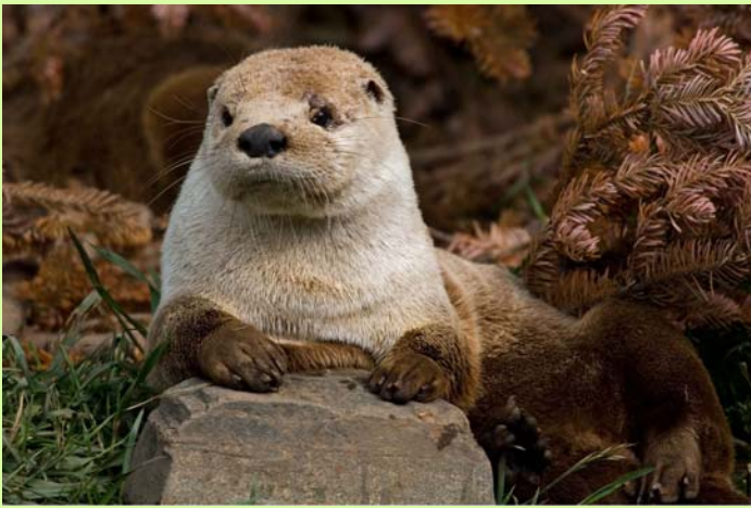
First Place Award Animals in Grandfather Mountain Habitats