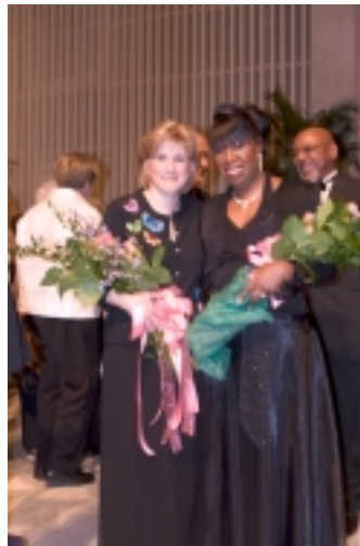
This photograph by Jim Hyatt is an example of the type of image that can be corrected by a pro photo lab.