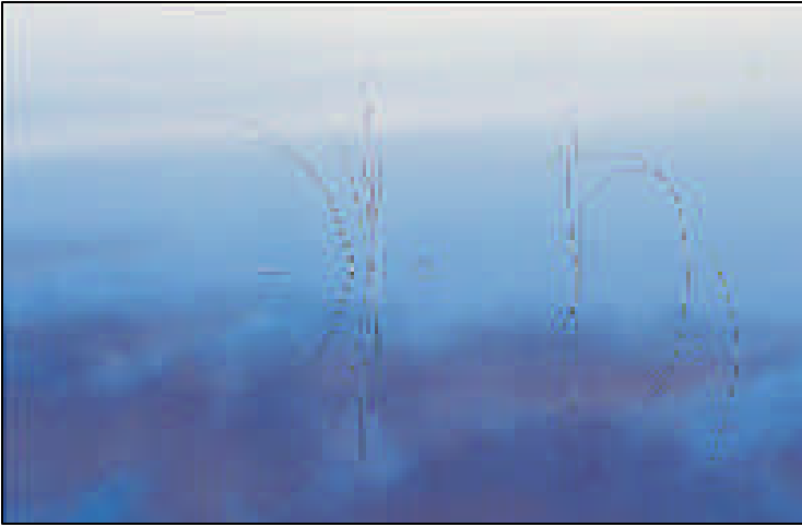
Dawn, Thornton Lake