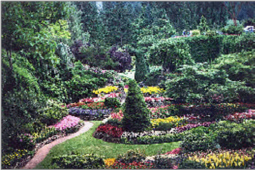
Butchart Gardens, Victoria, B.C.

For the past few years, it has been my good fortune to visit Vancouver, Canada; Vancouver Island, and some of the smaller Gulf Islands of British Columbia. Glacier topped mountains, spectacular beaches, garden-rich cities, and the quaint bays of the islands provide abundant photo opportunities.