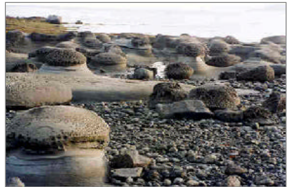
Sandstone Rock Formations, Hornby, B.C.

Places of interest on Hornby include two Provincial Parks. Helliwell Provincial Park has walking trails around old growth Douglas Fir, Garry Oaks, and groves of Arbutus trees. Wildflowers are at their peak in early spring, although many are found in summer also. From the cliffs there are spectacular views of Georgia Strait and the Coast Mountains. Tribune Bay Provincial Park has a white sandy beach with unusual carved sandstone formations bordering the beach. Starfish can be found clinging to the rocks and in the tidal pools at low tide. Amazing sandstone rock formations are found at various other locations on the island.