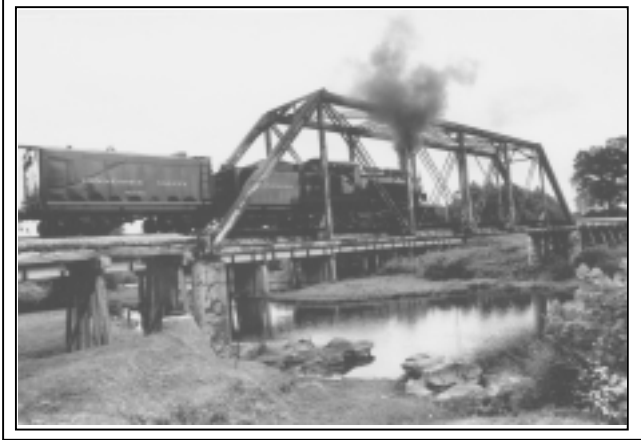
Brenda Cooper, 1st Place - Black & White