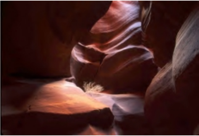
Deb Hebert, 1st Place - Color Slides