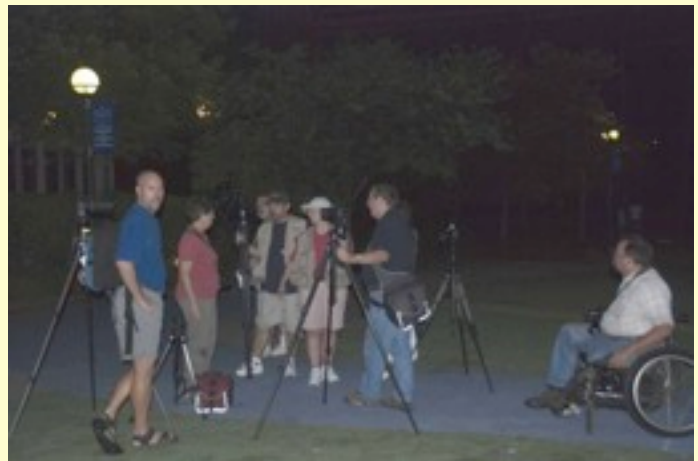
July 31 Fieldtrip: Twenty people went on the Point Park-Downtown shoot on Friday evening, July 31. Photo above of some of the "shooters" - Point Park canon photo below