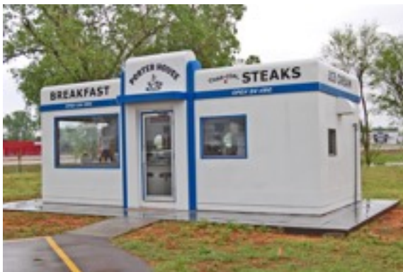
Weatherford, Oklahoma Elvis visited this diner three times

Route 66 has mainly been reduced to a service road along side Interstate 40. You can only imagine what it must have been like back in the hay days of old Route 66. Route 66 was only a two-lane highway with small towns stretched out with miles and miles of desert separating them. Most restaurants, gas stations and motels, that did exist, were all miniatures of today's giant chain stores. Most restaurants were basically small diners with bar stools for about six to ten customers. Some motels only had accommodations for as few as six customers a night. The gas stations were also tiny by today's standards with one bay for repairs and usually two pumps out front, one for regular and the other for ethyl gas.