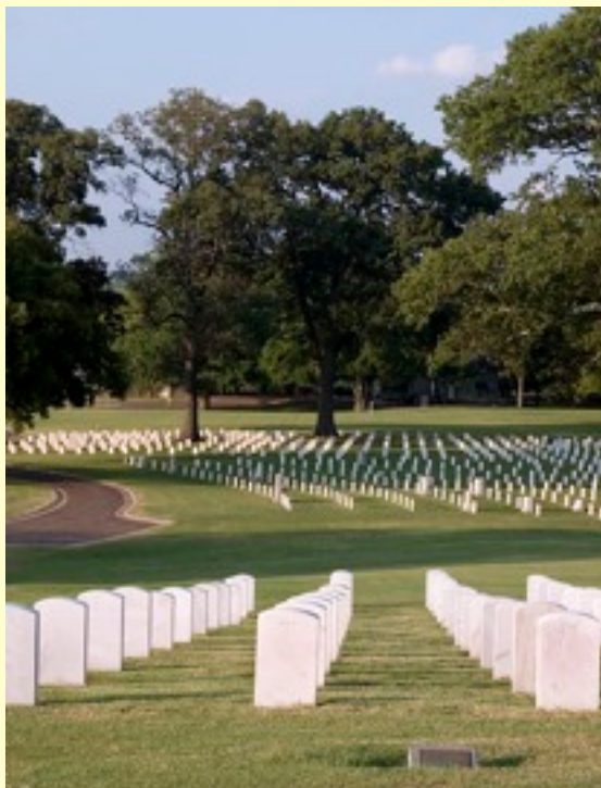
July 16 Fieldtrip: Sixteen PSC members photographed scenes at the National Cemetery, the sunset at the Walnut Street Bridge, night scenes on the TN River, and fireworks from the Lookouts game. This photo of the National Cemetery was taken by Pat Gordy.