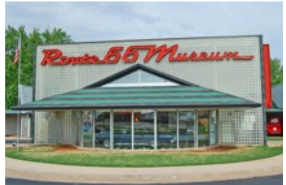
Favorite Place - page 4

Directions: From I-75 exit either on E. Brainerd Road East or Shallowford Road East - both roads will get you there. Christ United Methodist is located at the intersection of the two roads. Note: Shallowford Road name changes to Morris Hill Road which dead ends at East Brainerd Road.