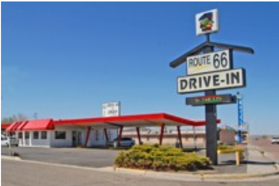
Gallup, New Mexico

When Betty and I took our trip out west in April and May, I was determined to see what was left of old Route 66. Unlike most people, I didn't research where old Route 66 was located. We just stepped out on faith.