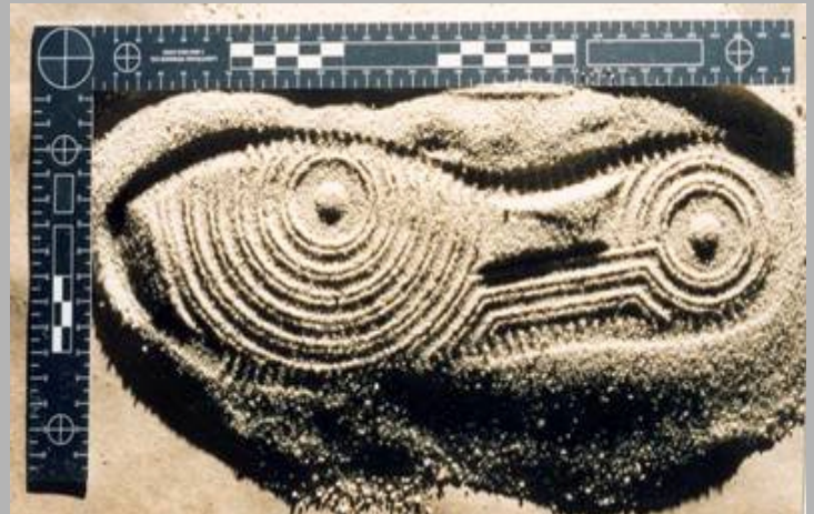
Shoe print

As I feared, our instructor postponed our field trip because the roads surrounding the monuments were inaccessible. We rescheduled for the following evening. On the following evening, to my dismay, law enforcement personnel were still negotiating with the tobacco farmer for the safe release of Abe Lincoln. Because of time constraints, we were not able to make a third attempt at photographing the Monuments at night. In spite of the failed field trip, the Evidentiary Photography Course was still very worthwhile and interesting.