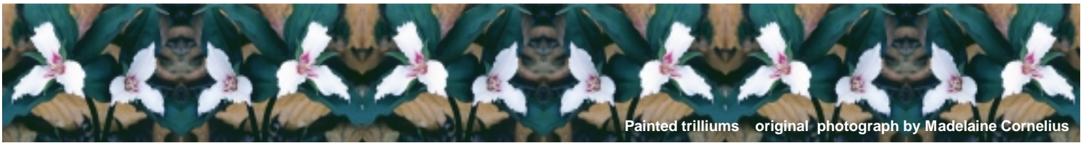
Painted trilliums