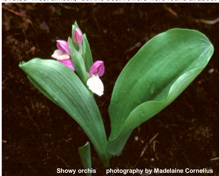
Showy orchis

For those of you who combine hiking and photography, there are excellent hikes of various levels of difficulty in the Standing Indian Basin. Our favorites include the Appalachian Trail 32 miles section, Bear Pen Gap 2.5 miles, John Wasilik Memorial Poplar 0.6 miles, Kimsey Creek 4.2 miles, Long Branch Trail 2 miles, Lower Ridge 4.1 miles and Timber Ridge 2.3 miles. Panoramic views reward those reaching the summit of Standing Indian and Big Albert.