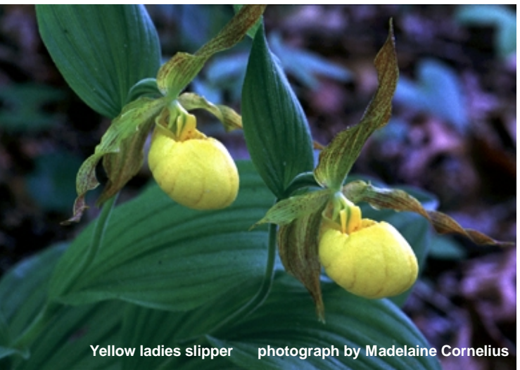
Yellow ladies slipper

The third suggested photo experience is along the Lower Ridge Trail leading up to Standing Indian Mountain. Last year on April 24th, we saw the most spectacular display of wildflowers along this trail. They were at their peak in full glory and we found different ones at different elevations to within a mile of the summit, where trout lilies carpeted the forest floor. The trail is 4 1/2 miles long and is rated "most difficult," but the best flowers were found at about 1/2 mile from beginning. If the time is right, the beauty will enthrall you. For those who do not wish to hike a mountain, painted trilliums can be found around some of the center campsites in the back loop. Also, the beginning of the Kimsey Creek Trail is level along the stream bed and some flowers can be found in this area.